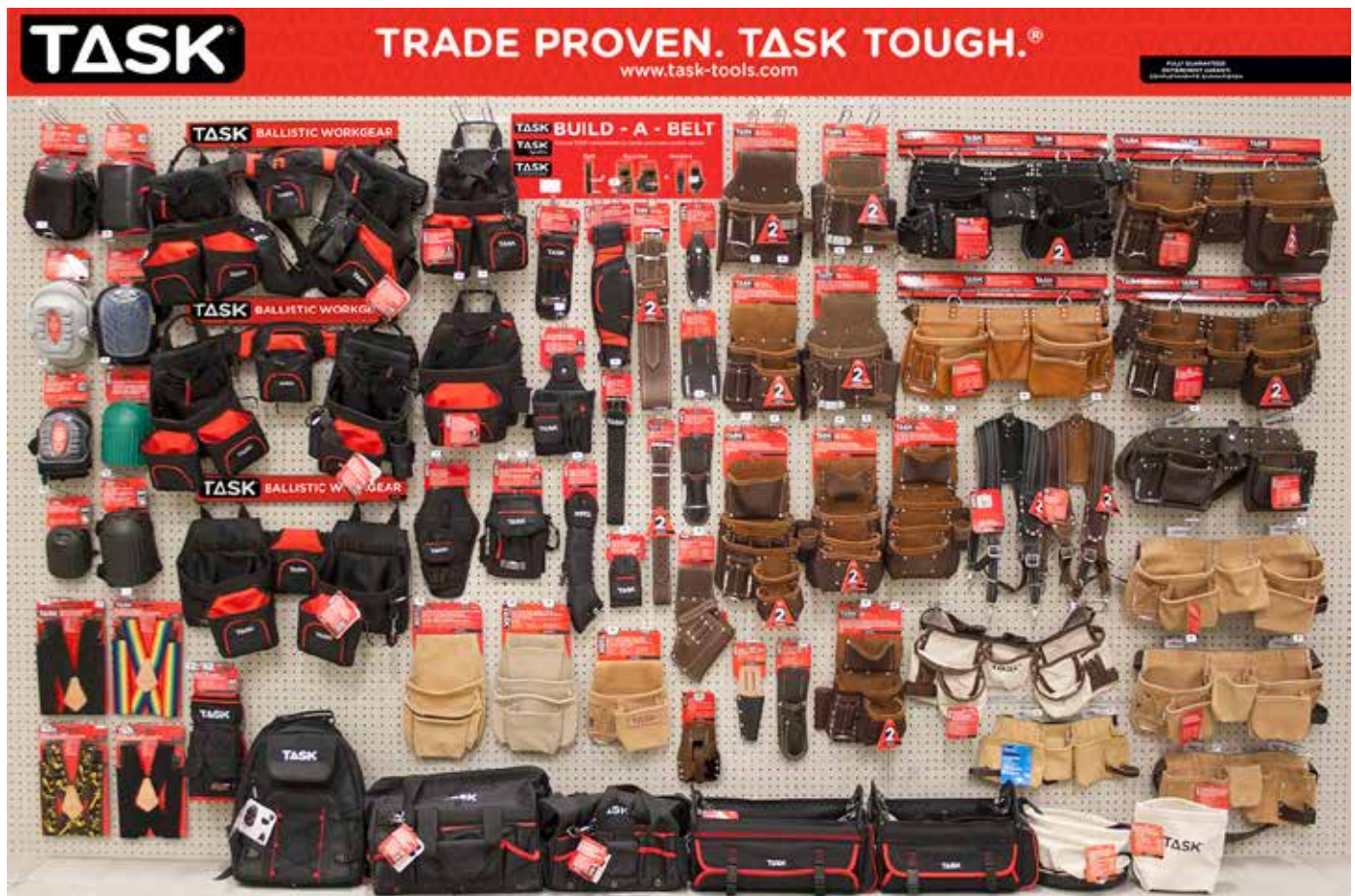
12' x 7' WORKSITE PLANOGRAM

See how TASK TOOLS® could look in your store!